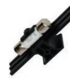
Fuse Cover With Fuse Puller